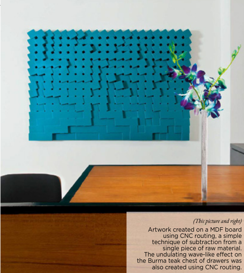
(This picture and right) Artwork created on a MDF board using CNC routing, a simple technique of subtraction from a single piece of raw material. The undulating wave-like effect on the Burma teak chest of drawers was also created using CNC routing.